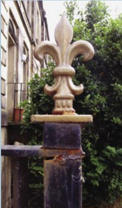
Image: poor quality replica in steel.

Combinations of cast and wrought iron are not unusual. There has also been much 'replica' ironwork re-instated to imitate cast iron railing spears in particular. Most utilise steel bars and cast steel, or cast iron heads, welded together. Much of this work is poorly executed, employing modern fabrication techniques and modern materials with inappropriate designs.