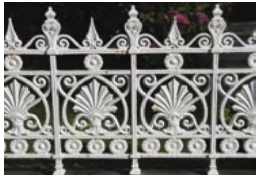
Image: Railing Spears with cope rail and baluster / railing panels.