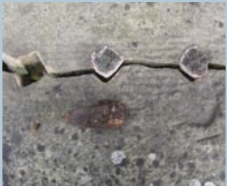
Image : Damage to masonry copes from wrought iron 'corrosion jacking' railing stubs

The removal of original railing stubs from boundary walls can be straightforward, or this may previously have occurred during the war effort, leaving a socket that can be re-used. Removing this stub and its lead surroundings can occasionally be more problematic, although not impossible. A decision should be made on balancing the ease of removal against damaging the adjacent stone. Another option is to drill out the original using a larger diameter core – but this needs to be carefully done without enlarging the socket too much. Leaving the stubs in place and installing the new ironwork between the original fixings can be employed, but very much depends whether the original design lends itself to this. Each individual casting should be secured into the masonry as originally fixed. The insertion of a lower bar, horizontal to the wall, is not recommended.