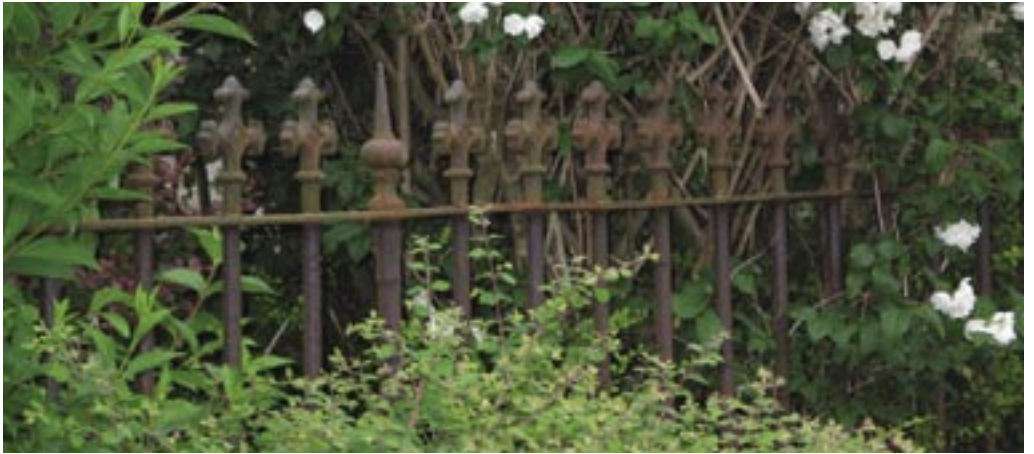
Image: Run of original railings left in street as a reference in 1942.

railing spears, grouped stubs possibly baluster panels), and the original shape if it was round, square or fluted. A regular newel or baluster post which is heavier and more structural may be found at regular intervals in railings.