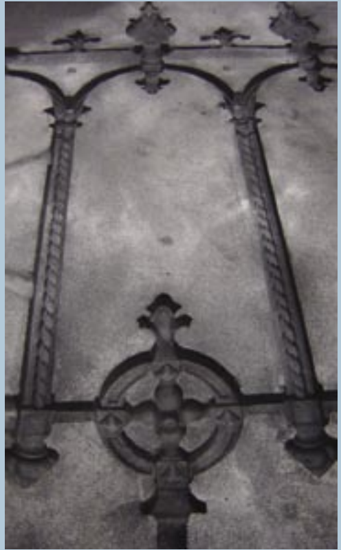
Image: Open greensand mould for baluster panel.

Original castings were made from stock wooden patterns in grey iron, moulded in sand by hand. Molten iron was poured into the mould to create a standard casting. Wrought iron was manufactured from cast iron through the puddling (heated and hammered to create an iron rich fibrous material) process. Unlike cast iron with its rigid structure, wrought iron is a wonderfully workable material in skilled hands at the forge.